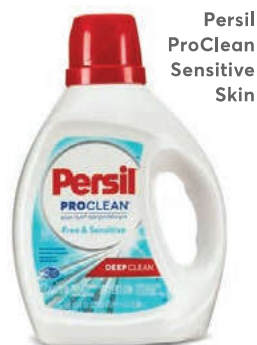
Sensitive Skin , 37 cents per load (shown above), which proved excellent at cleaning body oils, salad

But you may have to compromise on cleaning power. "Cleaning agents in 'sustainable' detergents tend to not be as effective as those in traditional formulas," says Handel. In our ratings (on page 22), "sensitive" formulas range from the relatively high-scoring Persil ProClean